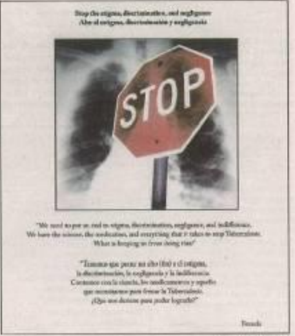
A sample of the artwork displayed at the Photovoice project.

Photowoice began collecting photos and bestimenies in September. amassing over too stories and accompanying images. Those were then used to create a display of 44 enlarged and framed images, with stories organized into four topics. One topic looks at what tabercalusis is one examines the corntional effect the disease has on its patients and families and another looks a social steps that can be takres by friends and family to useful TRipatients. Another is a cell to action for health and political policy makers to fund programs that better deal with TB and encourage attention to the disease.