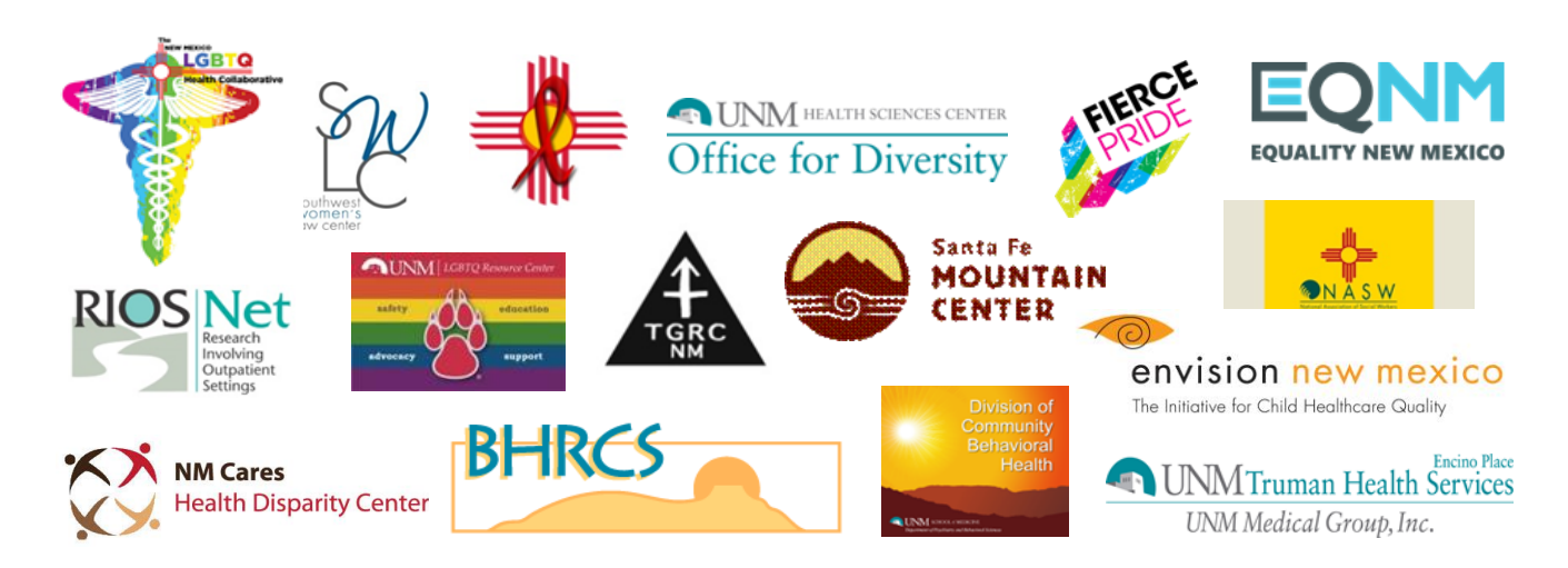
Figure 1 – Organizations represented in the New Mexico LGBTQ+ Health Collaborative

Once funded, we formalized this burgeoning community-academic partnership through the establishment of the New Mexico LGBTQ+ Health Collaborative (or "Collaborative" for short), a 15-person advisory board of healthcare advocates, patients, providers, and health services researchers from across the state (Figure 1). The Collaborative's agreed upon goal is to enhance knowledge of the experiences of gender and sexual minorities within health services in ethnically- and geographically-diverse communities in order to both plan and implement research that is necessary to improve quality of care for LGBTQ+ people.